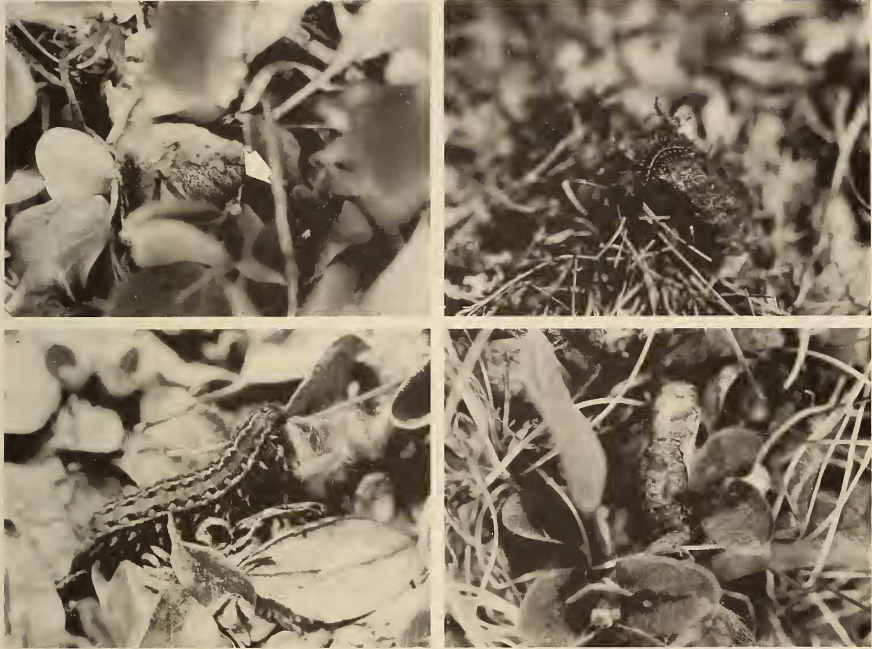
FIG. 1. Immature stages of Boloria acrocnema . Clockwise from top left: first instar and egg casing, third instar, pupa, fourth instar.

vae successfully produced adults, while 2 died of unknown causes. In 1992, larvae were found on June 29 and July 2, and in 1993 a single later instar larva was found July 7. All later instar larvae were found at RCI near oviposition sites, determined the previous summers. Caterpillars were observed feeding and basking for 2–3 days before nesting (larvae make a leaf shelter) and pupation. During the hours prior to nesting, larvae were observed to move rapidly around the enclosures and appeared to test areas for possible pupation sites. This behavior included crawling under litter, beginning to make a nest and then arresting movement. Finally, each caterpillar chose a site with densely packed litter and nested. In one case the larva burrowed under a large dead leaf and attached itself horizontally to the underside of the leaf, silking together debris (dead leaves, lichens, and bits of grass) to form a nest. No movement occurred after nesting and pupation began. In 1992, adults eclosed on August 2 and on August 7. Both of these larvae had pupated on July 7 (Fig. 1). In 1993, pupation was observed on July 9 and the butterfly eclosed on July 29. Therefore, in 1992 and 1993 the duration of pupation was 21 to 32 days.